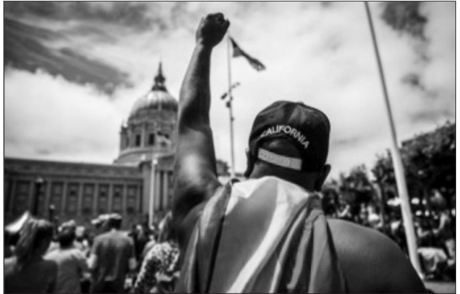
Marriage equality rally at City Hall, San Francisco

The ruling class seeks to divide our class based on nationality, gender, sexuality, age and so on. It would be foolish for working-class revolutionaries to seek to do the same. We recognize the weight of oppression is heavier on certain sectors of our class, that the very intention of the