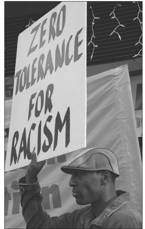
Protest at the Badlands bar, 2004

It is true that different class forces exist within the LGBTQ movement and that the community itself is not immune to racism or sexism, or to bigotry within the community, including prejudice by some lesbian and gay people against trans people. But that truth does not serve as the basis for analyzing and understanding the reality of the victories won by the LGBTQ struggle. The argument that the victory for marriage equality is reserved for only a certain section of the community, or that the movement for “gay rights” is somehow