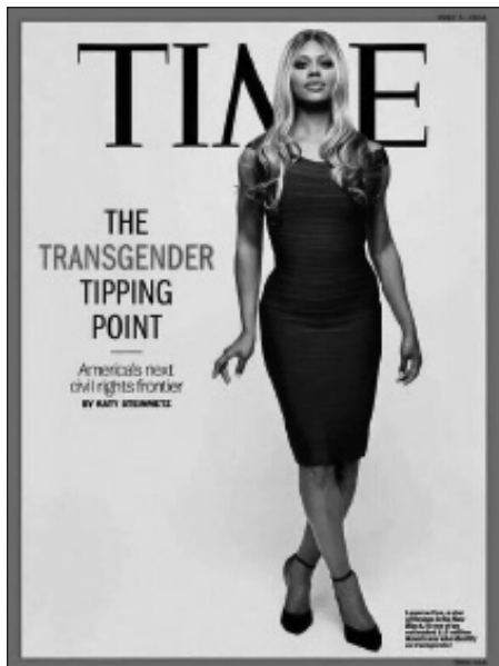
Laverne Cox on the cover of TIME

Recognizing this does not erase the fact that there is a crisis of violence and bigotry, a struggle for many to survive, but we truly had reached a tipping point. LGBTQ kids, including trans kids, coming out at a younger and younger age and fighting for their rights is a sure sign of this. Just this month, a Girl Scout chapter returned a $100,000 donation because the donor prohibited its use for trans girls—and in just the first day, a crowd funding campaign raised more than $230,000 (and raised $338,282 in one month) under the banner “Girl Scouts is #ForEVERYGirl.” That would not have happened just a few years ago.