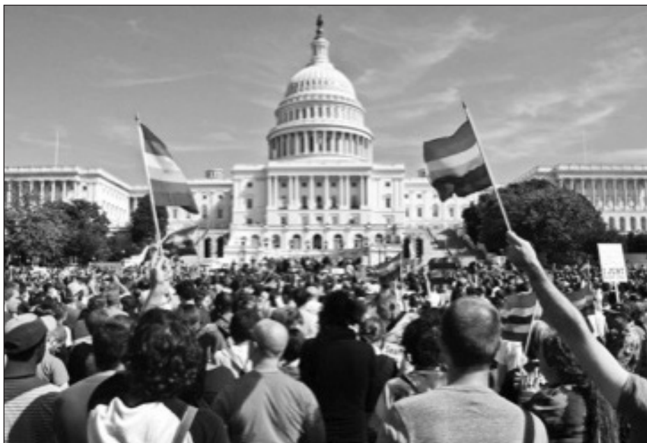
National Equality March, Washington, D.C., October 11, 2009

As revolutionaries and communists, we celebrate all progressive grassroots victories, and see them as opportunities to help the working class see that the people's intervention can be the decisive factor in history. Our focus at the time of a major victory is not to have the most left critique of it and the forces involved in it, but instead to show that it is a victory that came from the struggle of the people—not from the capitalist politicians or courts. In this case, even the Supreme Court's opinion recognized that the outcome flowed from the public opinion in the country, which has shifted dramatically in a remarkably short period of time because of the people's struggle.